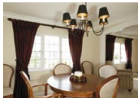
DINING AREA Circular table can be extended

The window in the dining area is fairly deep and in common with those throughout the home is double-glazed, uPVC-framed and fitted with Georgian glazing bars. Blackcherry silk curtains are full, pinch pleated and hang to floor level from decorative wooden poles, while a semi-circular sideboard in a very grand design provides plenty of storage space in