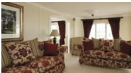
LOUNGE Sumptuous styling and large sofas

Two circular lamp tables with drawers are included and the television table offers plenty of space for audio/visual accessories. The show model featured here included some £10,000-worth of this equipment with a very impressive control console. That is obviously an optional extra but was included in the show home to demonstrate the type of features that can be included in a luxury home like this. There was also an electronic lighting control system, ensuring you get the right mood both indoors and out.