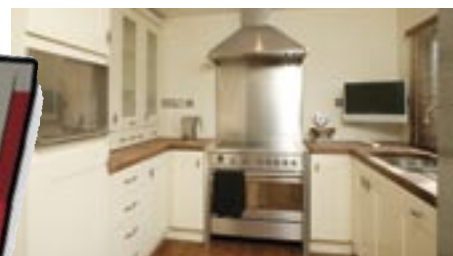
KITCHEN Features luxury underfloor heating

As you enter from the dining area there are floor to ceiling cupboards incorporating a microwave oven. There's a large range cooker with a chimney hood and to add to the