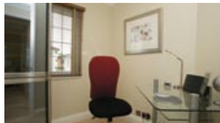
STUDY A great place to surf the internet

On the opposite side of the home, the area 'behind' the hallway houses the study, bathroom and second bedroom. The study is small and compact and, of course, modern as it has been fitted out to meet the needs of someone who is likely to use it as a