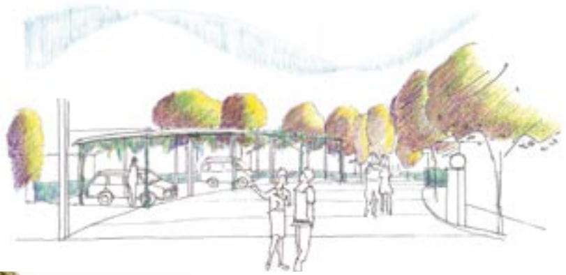
above Attractive car ports will replace garages

behind this scheme is to prove that park home developments do not simply have to replicate an urban environment in a rural setting. There is a much more sophisticated level of operation that we hope will act as a catalyst for the industry as a whole, bringing a much needed change of direction that inspires more radical thinking among park home developers.'